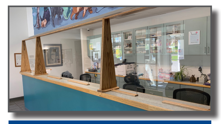
Plexi-Glass with oak framing for professional appearance

Provide help in connecting your company to additional resources to ensure the essential criteria is accomplished.