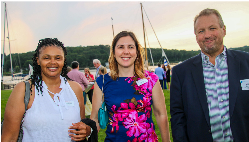
Guests enjoy the Chamber's Regional Awards Celebration on July 22.