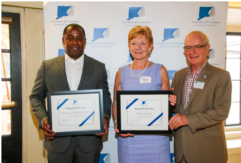
Lawrence + Memorial Hospital (YNHH) and Backus Hospital (Hartford Healthcare) were recognized as the 2020 Nonprofits of the Year.