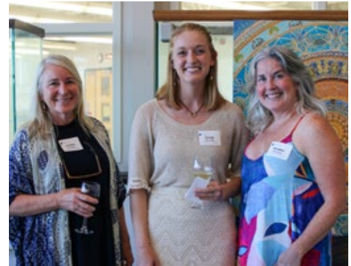
Members gather at Project Oceanology in Groton for a Business After Hours, presented by Scient Federal Credit Union.

Joining the Chamber is an exciting and engaging time for new members. They are welcomed into the Chamber and immediately given new member perks including passes to Business After Hours, a web ad on our website, and other marketing initiatives to help broaden their reach in the community.