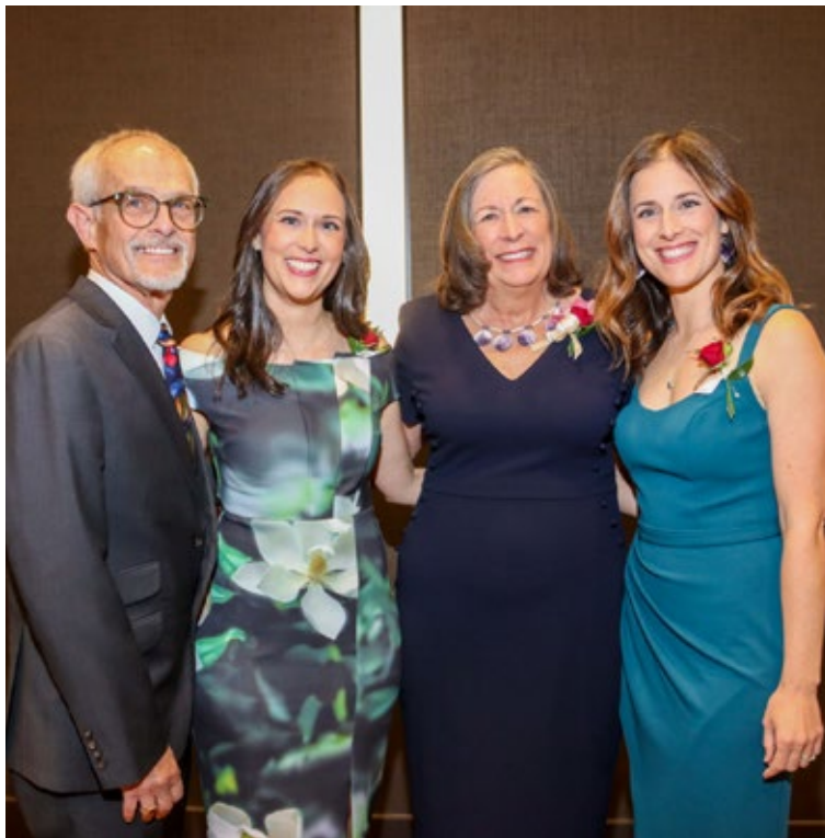
▲ On May 23rd, we celebrated our 72nd Annual Citizen of the year, Chief Many Hearts Lynn Malerba, Treasurer of the United States and the 18th Chief of the Mohegan Tribe. Over 400 members gathered to congratulate this year's recipient, enjoying an evening of good company, heart-felt presentations, and creative culinary delights surrounded by a thematic ambiance.