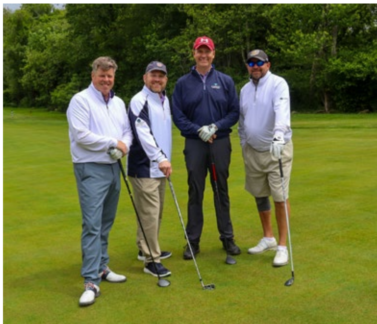
▲ On June 5, we held our 35th Annual Golf Tournament at Stonington Country Club.

Events make up one great aspect of Chamber offerings to our members and community partners. They help bring people together, promote learning, build relationships, and support small and large businesses. It is crucial for us to provide a well-rounded experience at each event whether a ribbon cutting or a luncheon. Enjoy some snap shots encapsulating some grand moments.